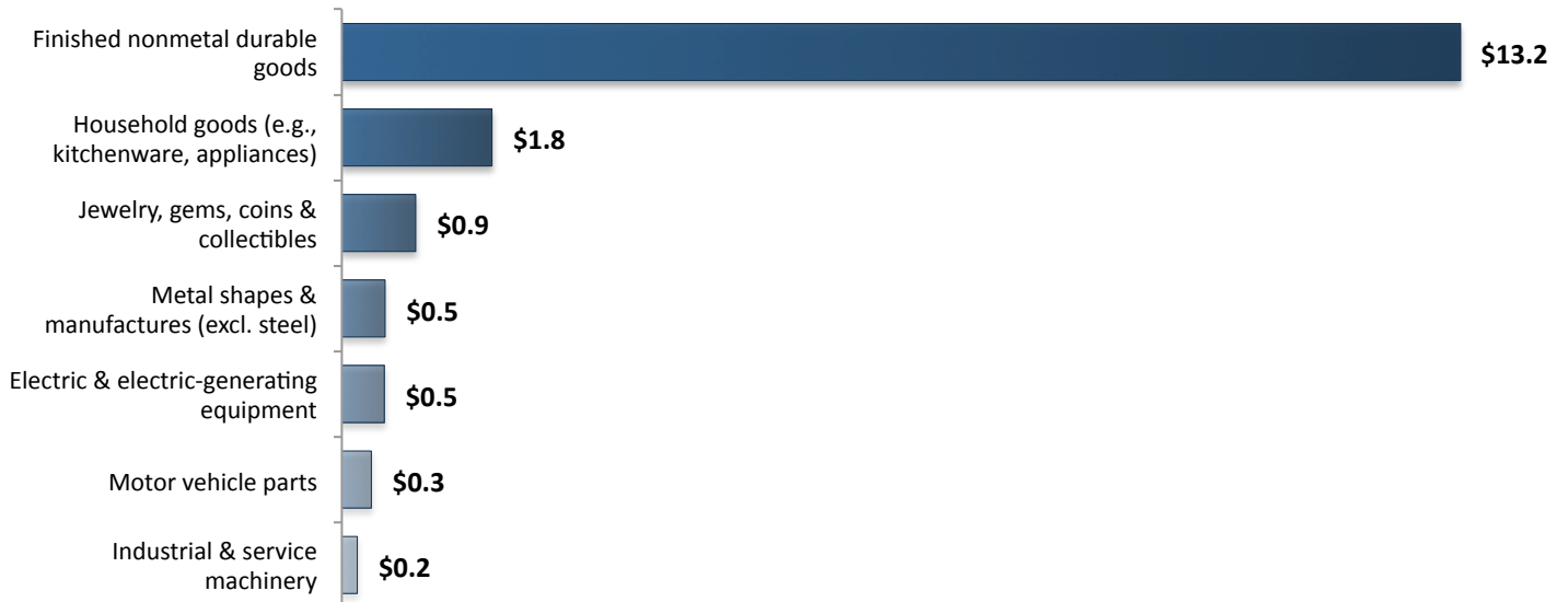
South Dakota's GSP Imports, 2012 ($ millions)

Most South Dakota imports under GSP are raw materials and industrial goods whose duty-free treatment helps South Dakota companies remain competitive.